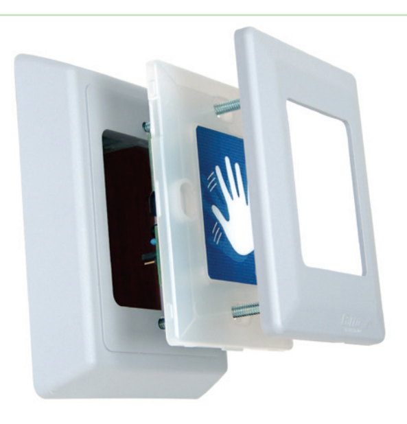
U-WAV is easy to install